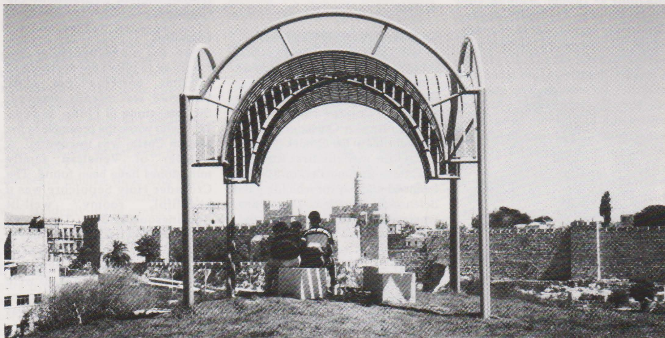
Old Jerusalem seen through the architecture of the 1980s.