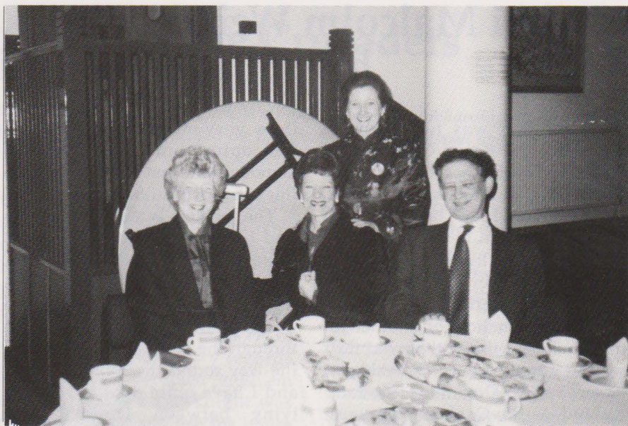
The performers at the Friendship Club Tea