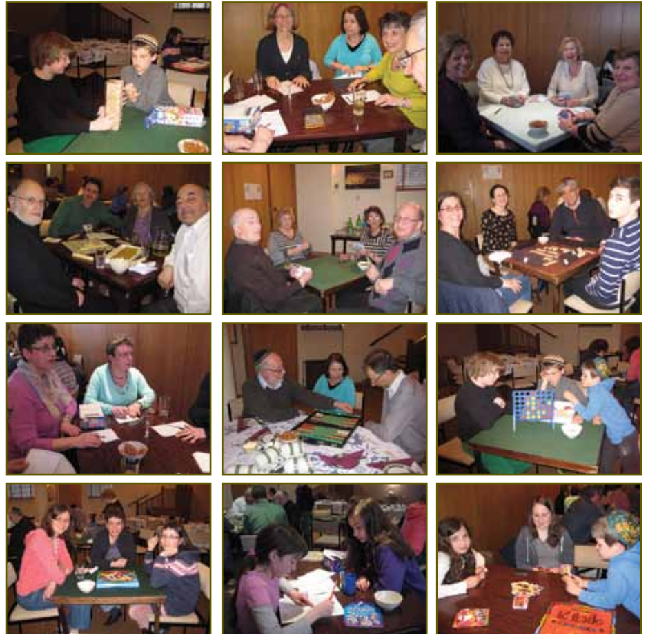
Players of all ages concentrating on the games