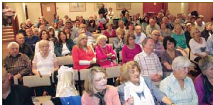
The Marian Oppenheim Hall was packed to capacity for the Festival Open Day on Sunday 18 August 2013