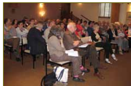
Forty eight members attended the AGM