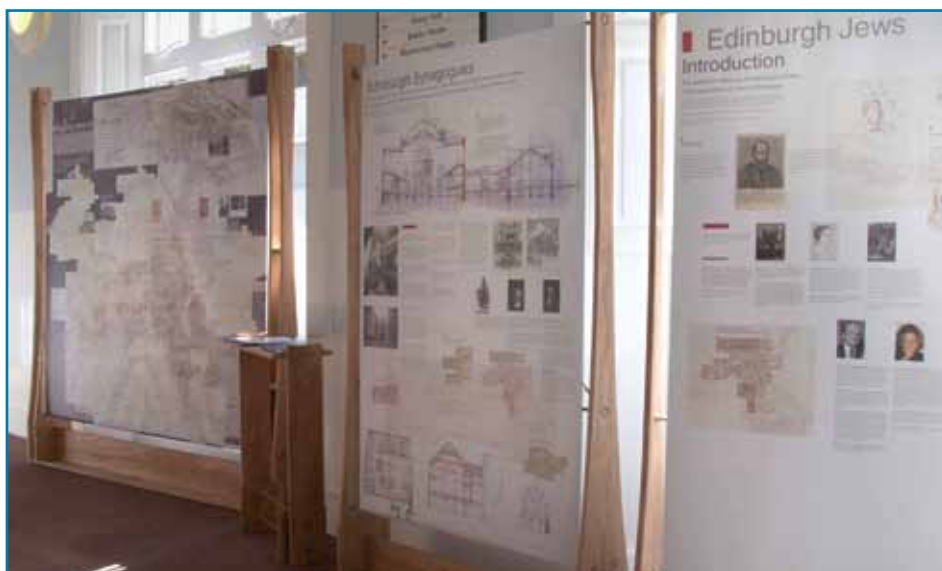
Part of the Exhibition

The exhibition 'Edinburgh Jews' offers a unique insight into the history of the city in relation to the long-established Jewish community, whose presence in Edinburgh can be traced back to the middle of the eighteenth century. It offers an overview of a fascinating history which encompasses both local interest and the impact of global conflicts on the city and Jewish population. Detailed topographical mapping of Jewish life in Edinburgh for the period 1894 to 1969 identifies the community's homes, places of work, types of professions, and public spaces. Each display combines informative text, newspaper articles, personal recollections, historic maps, paintings, drawings and photographs. A number of sources are from private family collections, which have never before been on public display.