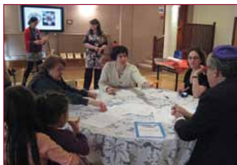
Yom HaAtzmaut celebrations at EHC