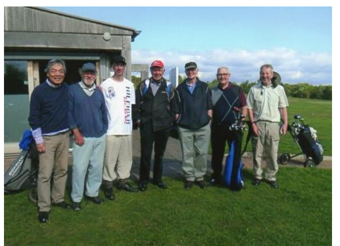
Steven meets up with a plethora of visitors to our Tournament.